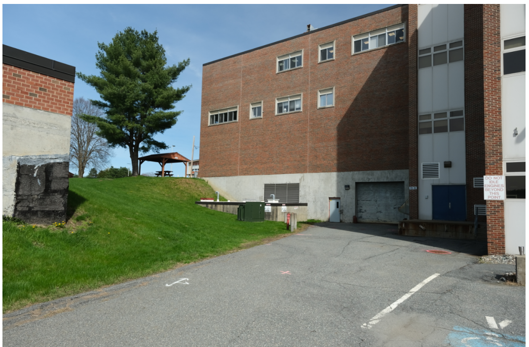
Exterior of building and bay doors into sub-basement