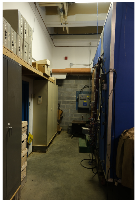
View showing limited space on left side of existing defunct chamber