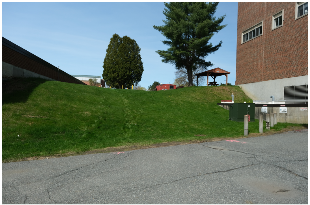
Exterior possible location for any necessary equipment