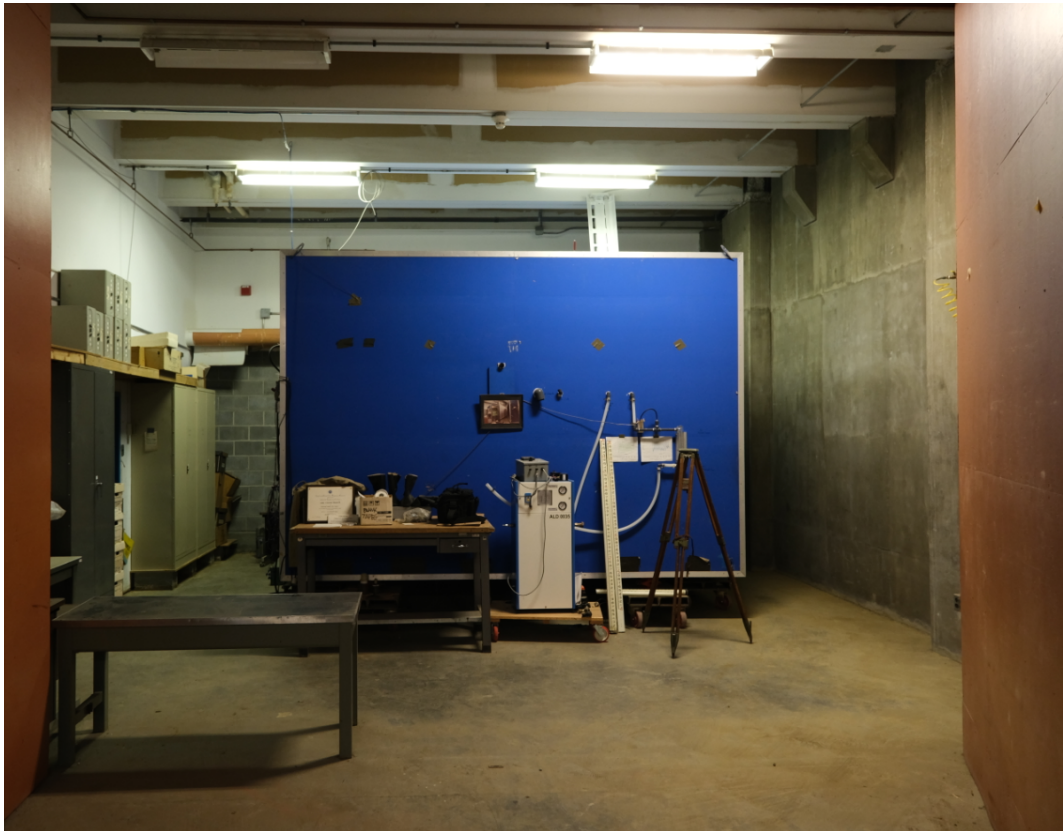
View of existing defunct chamber (will be removed/cannot be repurposed)