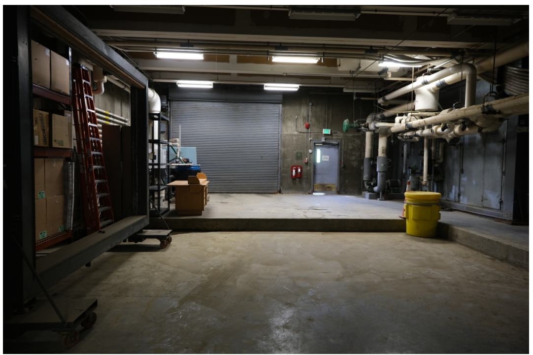
View from defunct chamber location towards exterior bay doors