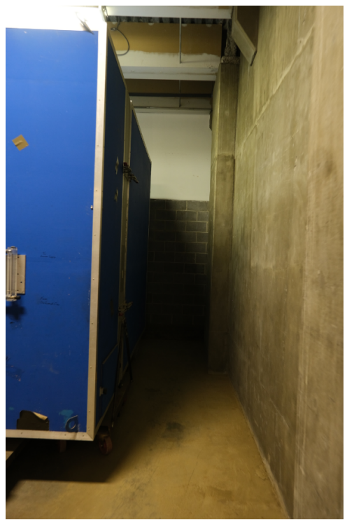
View showing limited space on right side of existing defunct chamber