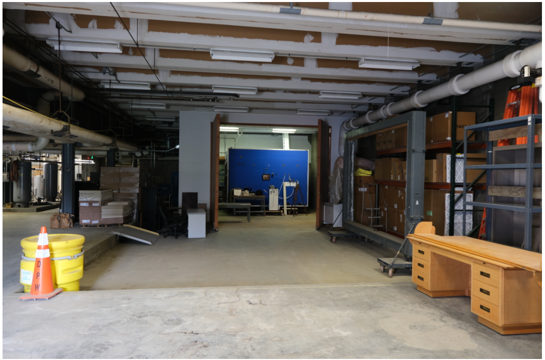
View from exterior bay doors into sub-basement