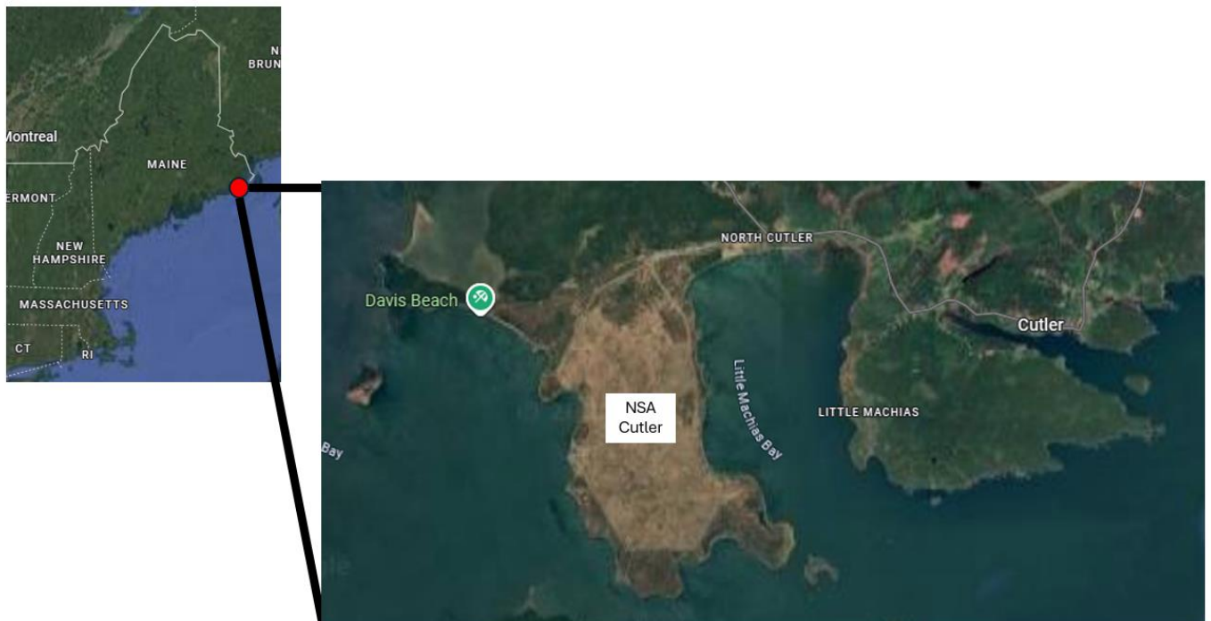
Figure 1. Location of NSA Cutler.

The site is located at Naval Support Area (NSA) Cutler in Cutler, Maine and is representative of a DoD military installation that operates in an environment that is frequently subject to extreme weather events and extreme variabilities in temperature and is located within the Gulf of Maine with a high (~ 4 meters) tidal range (Figure 1). This naval installation is responsible for relaying critical military communications in the Atlantic Ocean, Arctic Ocean, and Mediterranean Sea. However, weather-related events (e.g. coastal storms, storm surge, and high winds resulting in flooding and erosion) threaten the installation's infrastructure, and the Navy must develop innovative interventions to cost-effectively reduce risks to military readiness.