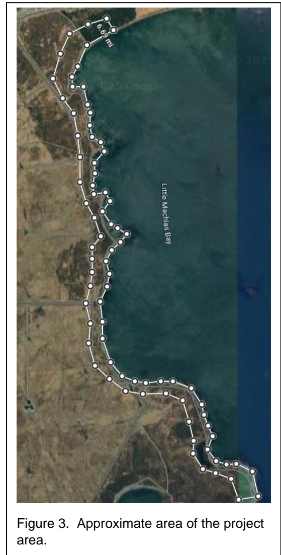
Figure 3. Approximate area of the project area.